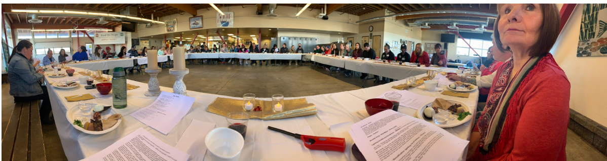
Passover Seder Dinner