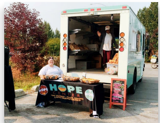
Bike Week at House of Harley